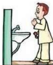
brush your teeth