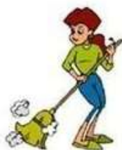
sweep the floor