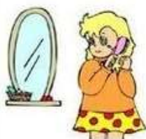
brush your hair