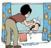
wash your hair