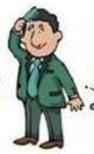
comb your hair