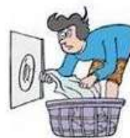
wash the clothes