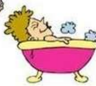
have a bath