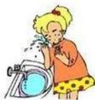
wash your face