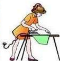
iron the clothes