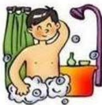
take a shower