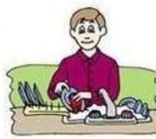
wash the dishes