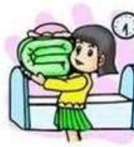
make the bed