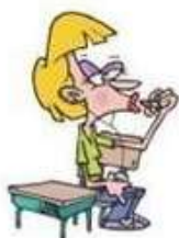
put on makeup