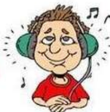
listen to music