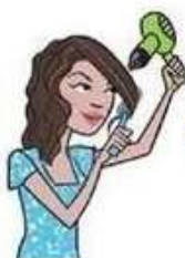
dry your hair