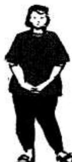
short and fat