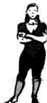
medium height and very muscular

Note: Another word for slim is thin , but slim has a more positive meaning, e.g. John is lovely and slim, but his brother is terribly thin. Skinny also has the same meaning but is very negative. It is not very polite to say someone is fat ; overweight is more neutral and polite.