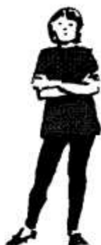
medium height and build