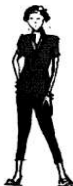
tall and slim